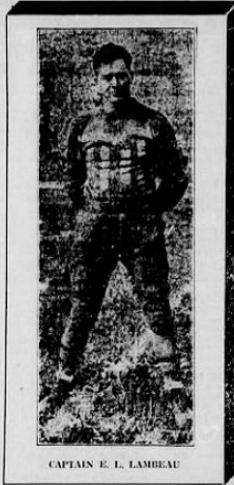
CAPTAIN E. L. LAMBEAU