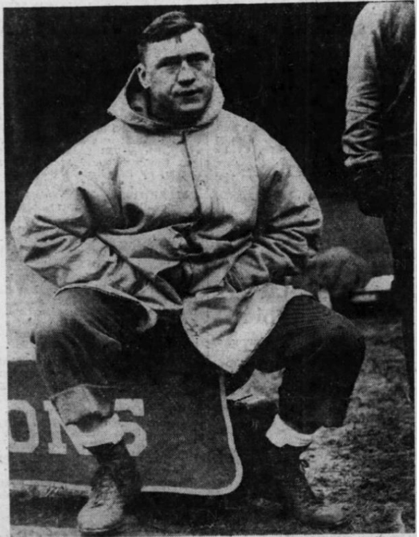
Bill Dudley, the Detroit Lions' star halfback, sits out Sunday's game with the Green Bay Packers. Bill looks a little sad here, and you can't really blame him. In addition to being laid up with injuries Dudley watched the Lions go down to a 35-14 defeat, their ninth of the year.