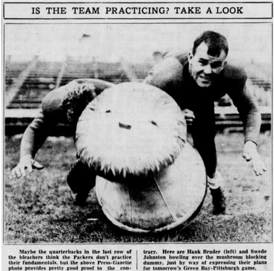
Maybe the quarterbacks in the last row of the bleachers think the Packers don't practice their fundamentals, but the above Press-Gazette photo provides pretty good proof to the con-

OCT 4 (Green Bay) - Sunday will be "high school day" at City stadium, when hundreds of Wisconsin and Upper Michigan high school and junior high students will take advantage of a special Packer ticket offer of 50 cents each to witness the