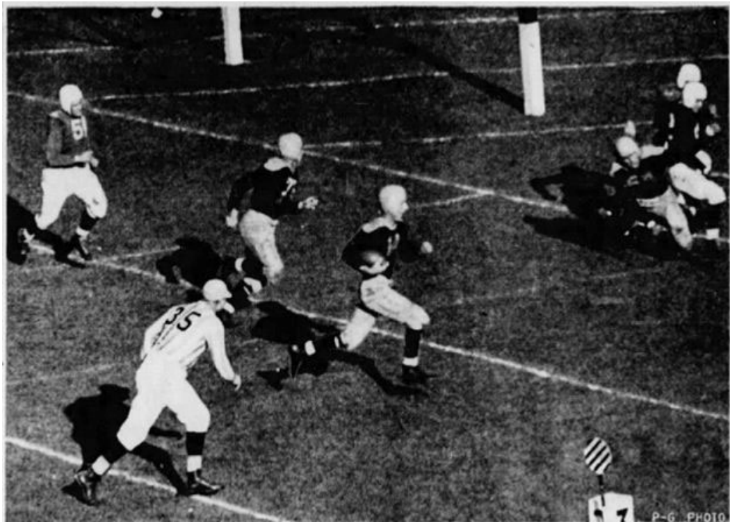
Taking off on a perfectly executed end-around play, End Don Hutson romped 12 yards for the Packers' second touchdown against the Chicago Cardinals at City stadium Sunday afternoon. The score came shortly after the second quarter opened. Hutson was aided by a fancy bit of blocking on the goal line, shown at the right of the photograph. Although the Cardinals scored immediately after, the Packers won handily, 33-14.

taken for granted and receive the most publicity when they have a "bum day". But weekly NFL statistics released today show that Baugh, 31, the Rotan, Tex., rancher with the rifle-shot arm, and Hutson, 32, the Green Bay bowling proprietor with the sticky fingers, remain the greatest in their departments the game has ever seen. Slingin' Sammy has pitched 88 passes and completed 61 times for 781 yards and a .694 average, an all-time high for the willowy Texan. That's hitting seven out of 10 throws, comparable to winning 30 games in baseball's major leagues. Huston is running neck-and-neck with Sammy. The "Darling of Green Bay" has caught 29 passes of the Packers' 40 completed passes for 633 yards, and has scored 75 points, 48 percent of