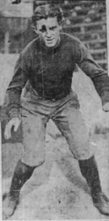
Laverne Dilweg, Marquette star of several seasons ago, continues to be a star at end in the pro game.