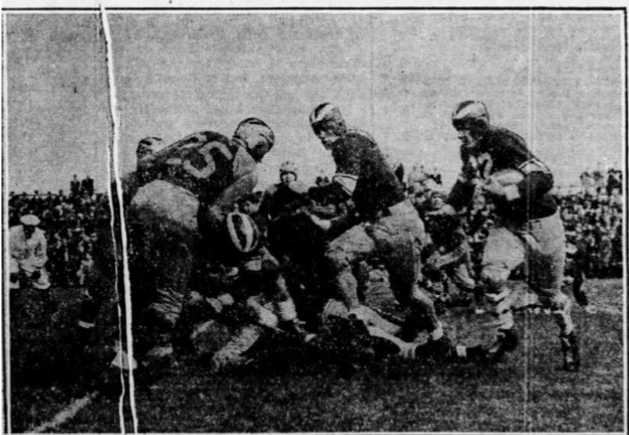
Pug Vaughan, Chicago Cardinal half back, starts on a 22 yard run in yesterday's game with the Green Bay Packers at Milwaukee. The Packers mixed power plays and passes for a 24-0 victory.