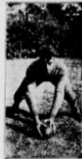
"BOOB" DARLING Center