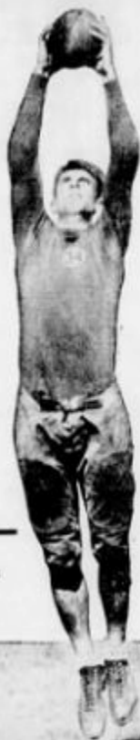
LAVVIE DEWEG End