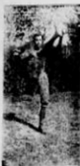
VERNE LEWELLEN Halfback

Refresh Yourself at McDONALD'S Drug Store