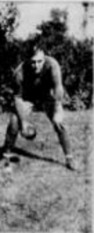
"JUG" KARPIS Center

Automobile Accessories, Tires, Batteries, Radios All at Cut Rate Prices