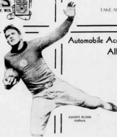
JOHNNY BLOOD Halfback