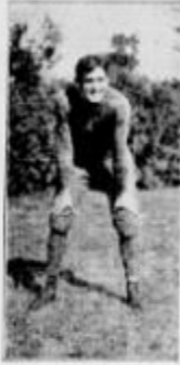
JOHNNY BLOOD Halfback