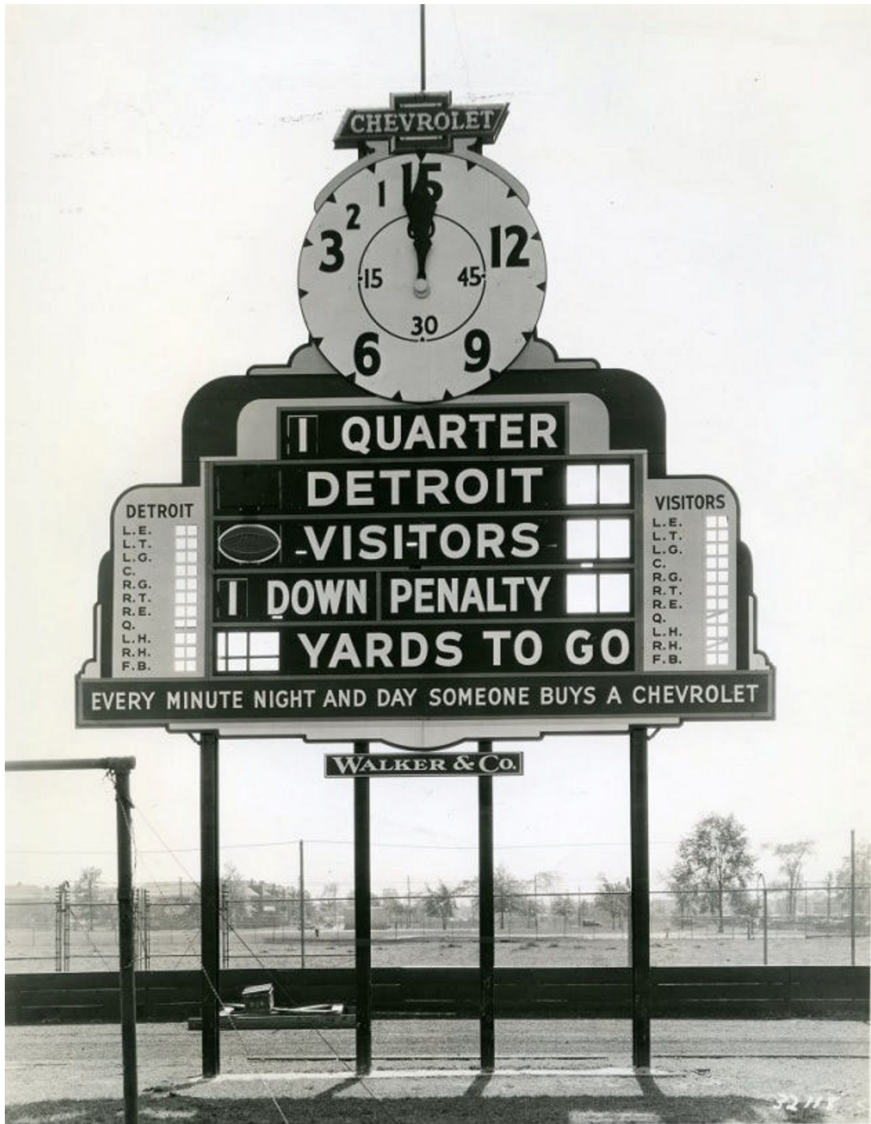
c. 1935, football scoreboard at University of Detroit Stadium

University of Detroit Stadium - The stadium stood on 6-Mile Road (later also known as McNichols Road) just west of Fairfield St. in the northeast corner of the campus. It was built with the field on a north-south axis, with stands on the east and west sides of the field, which was encircled by a running track. It had a capacity of 25,000 people at its peak. In addition to football, it was also used for track meets, concerts, and other university-related and public events. One rather unusual aspect of the stadium was its lighting towers, which stood between the stands and the field. The Stadium was the home field for the NFL's Detroit Lions from 1934 to 1937, and again in 1940. The Lions