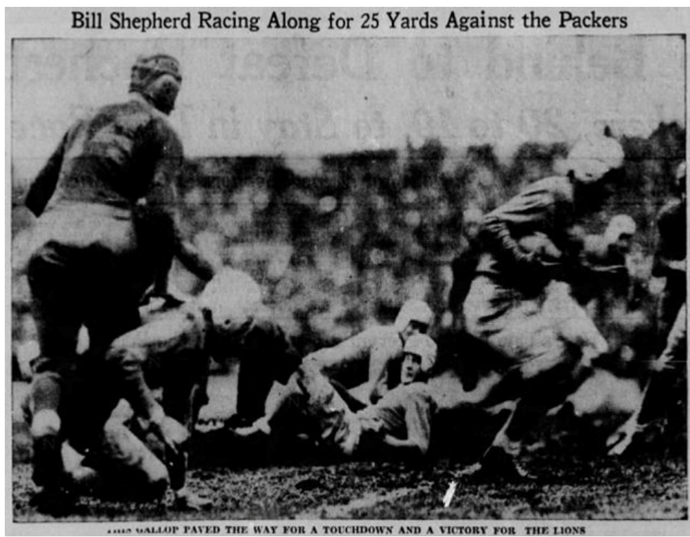
...GALLOP PAVED THE WAY FOR A TOUCHDOWN AND A VICTORY FOR THE LIONS